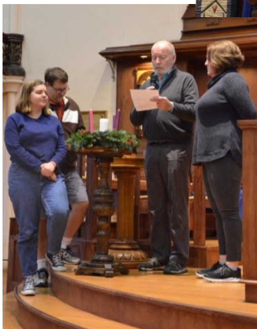
The Garson/Aerts family