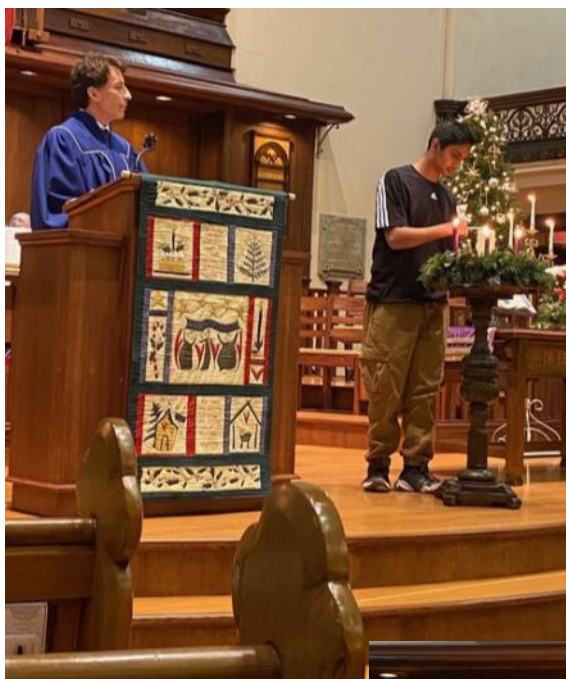
The Barwise family