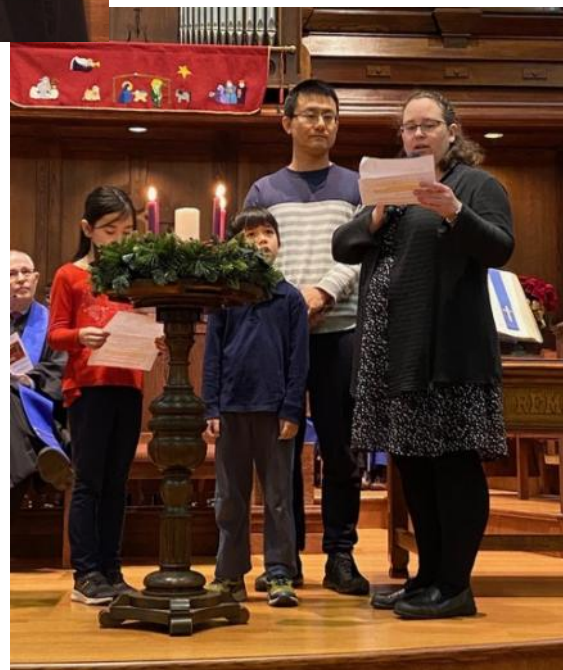
The Hawkes/Yu family