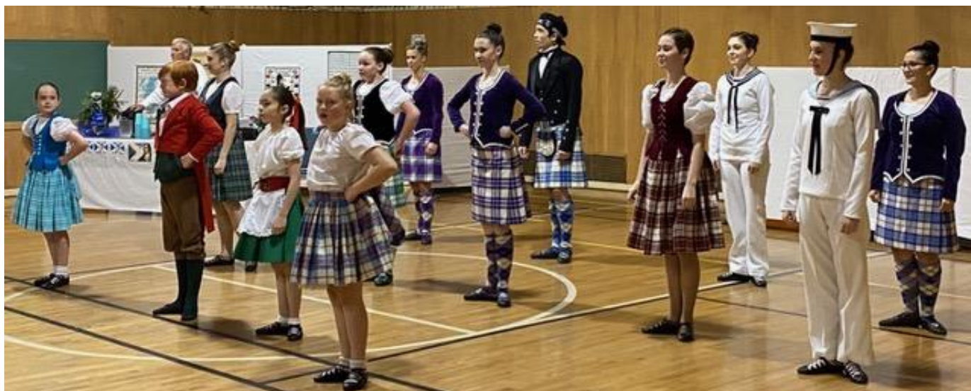
Bon Accord Dancers