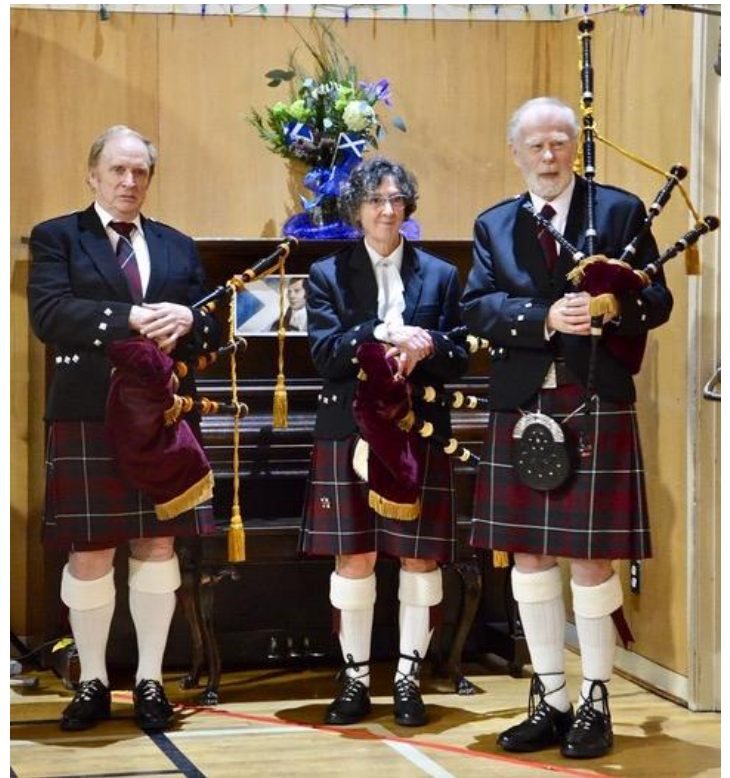
Pipers from the Saanich Peninsula Pipe Band