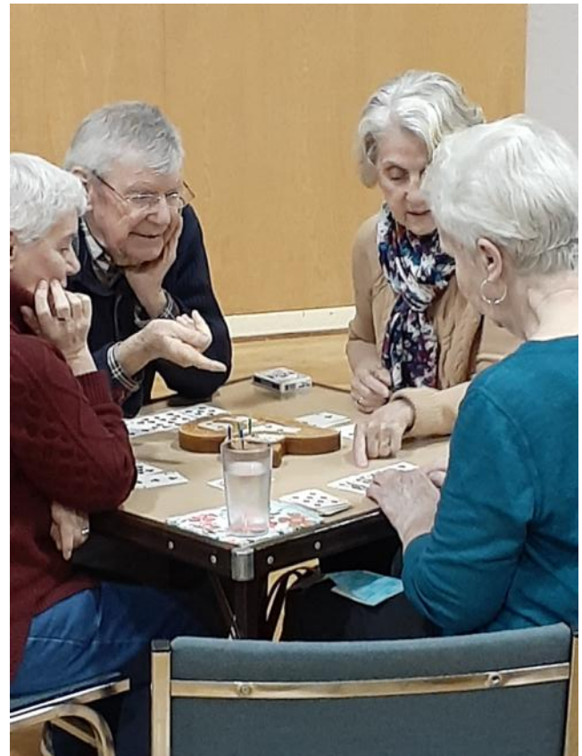
Learning and discussing the finer points of Cribbage.