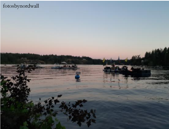
Barges listening to the band at sunset