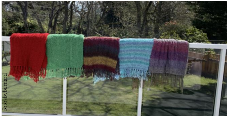
These prayer shawls have all gone to good homes.

shawl ministry is Congregational Life. At present, I have one other person who is knitting a shawl and so, if you are interested in knitting for this fledgling prayer shawl ministry or if you know of someone who might benefit from receiving a prayer shawl, please let me know