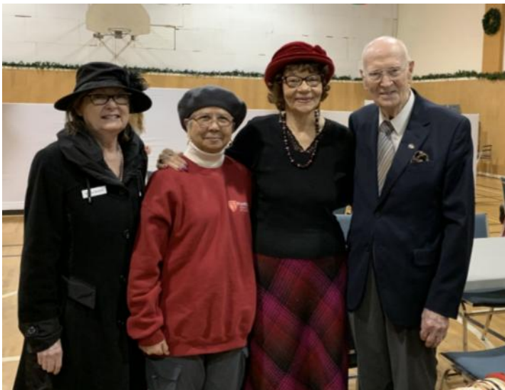
Coffee Hour Pre-Covid Time