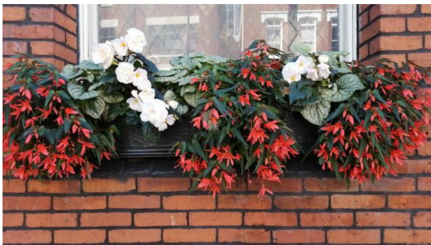
Flowers at St. Andrew's!