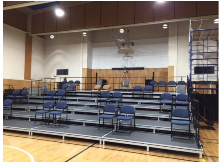
Transformation in the Kirk Hall showing limited seating and social distancing for the Ballet Victoria Pandemic Playhouse.

Next Link deadline will be Sunday, November 29.