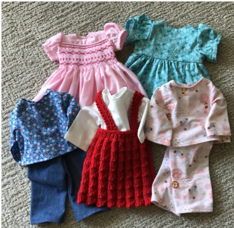
Knitted and fabric clothes made for an 18 inch American Girl Doll for a family friend's little girls.