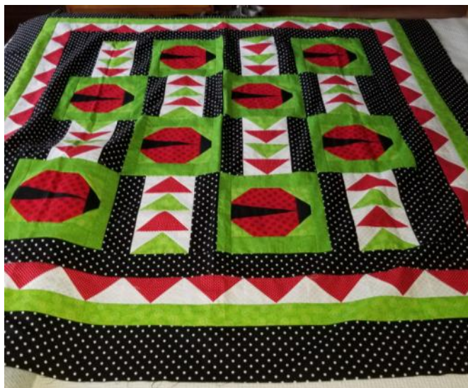
A baby quilt made for the birth of a great niece.