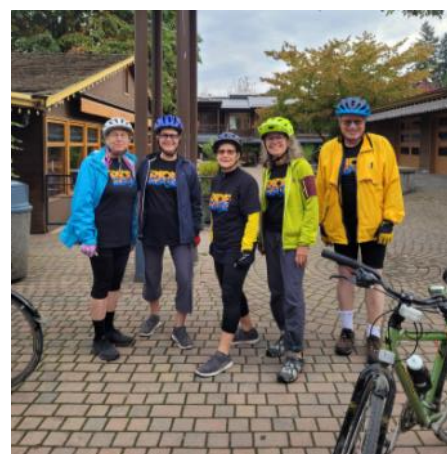
Five cyclists from Knox and St. Andrew's cycled a combined distance of 280 km on Saturday, Oct. 2, raising $4,230 for PWS&D. Thank you to all who sponsored them! This is an annual event, and they would welcome new team members to join them in 2022!