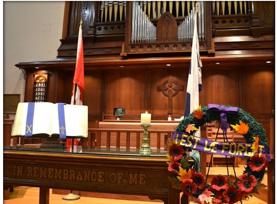
November 7, 2021 Remembrance Day Sunday