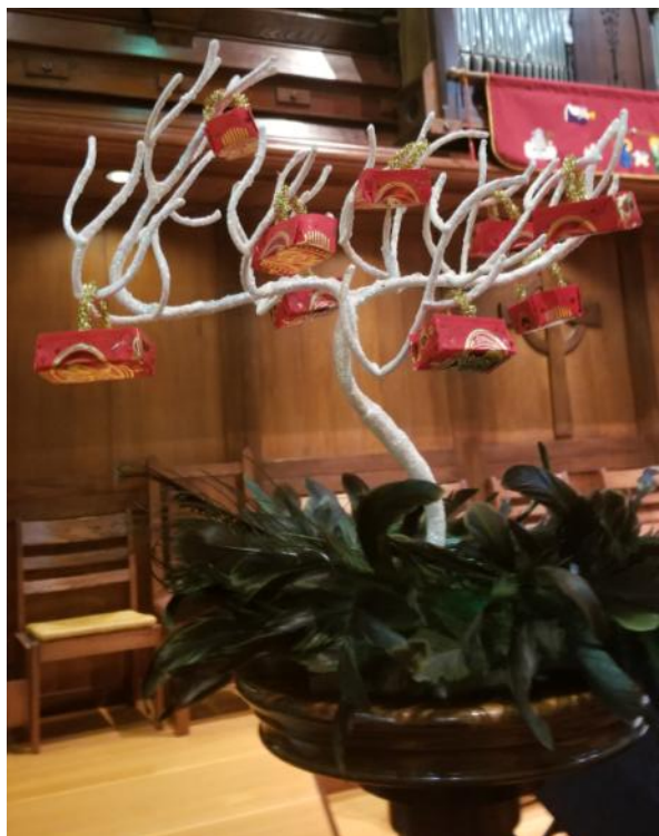
'Share the Joy' Hamper Tree

Thank you to everyone who has responded to Share the Joy of Christmas so far this year. We have received enough money for eight-and-a-half hampers for needy families in Greater Victoria. Our goal is 15 hampers. It costs $147 to fill each hamper.