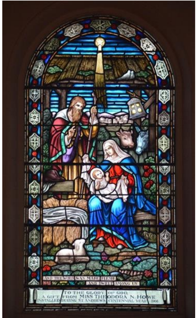
Our Own Nativity Scene