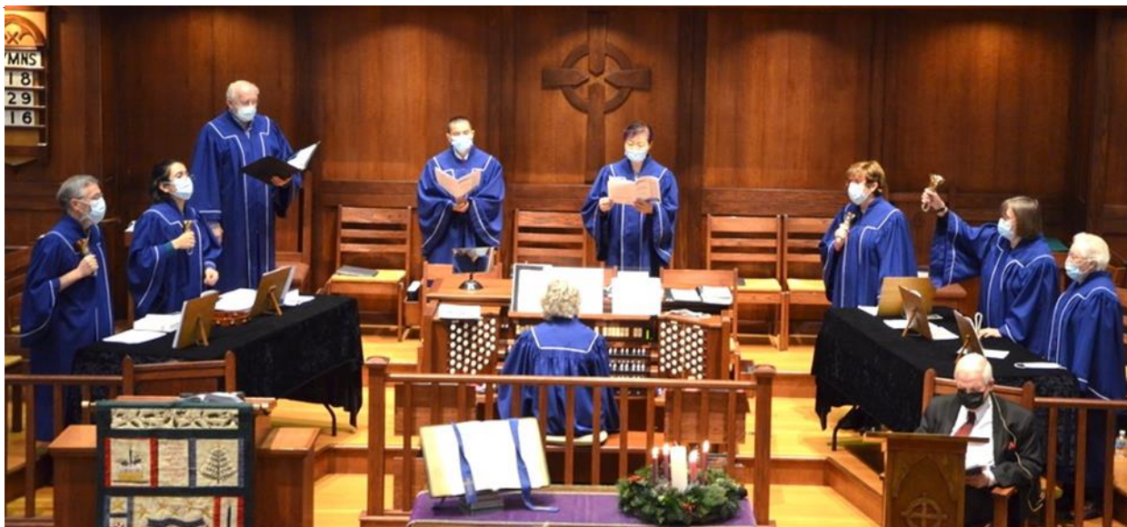
Music and Song heard during December included Love's Pure Light sung with bells by St. Andrew's Choir.