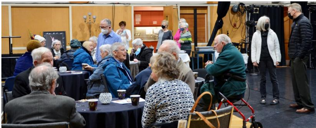
Our first Coffee Hour since March 8, 2020 held on April 10, 2022! It was a much welcomed addition to our Sunday Service.

Maintaining our kitchen by working together!