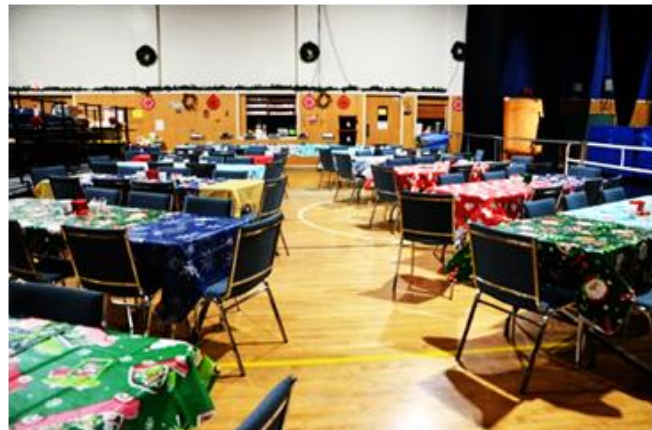
Recovery Christmas Dinner - 250 - 300 guests were expected.