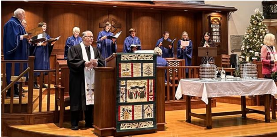
Communion Sunday, December 3, 2023