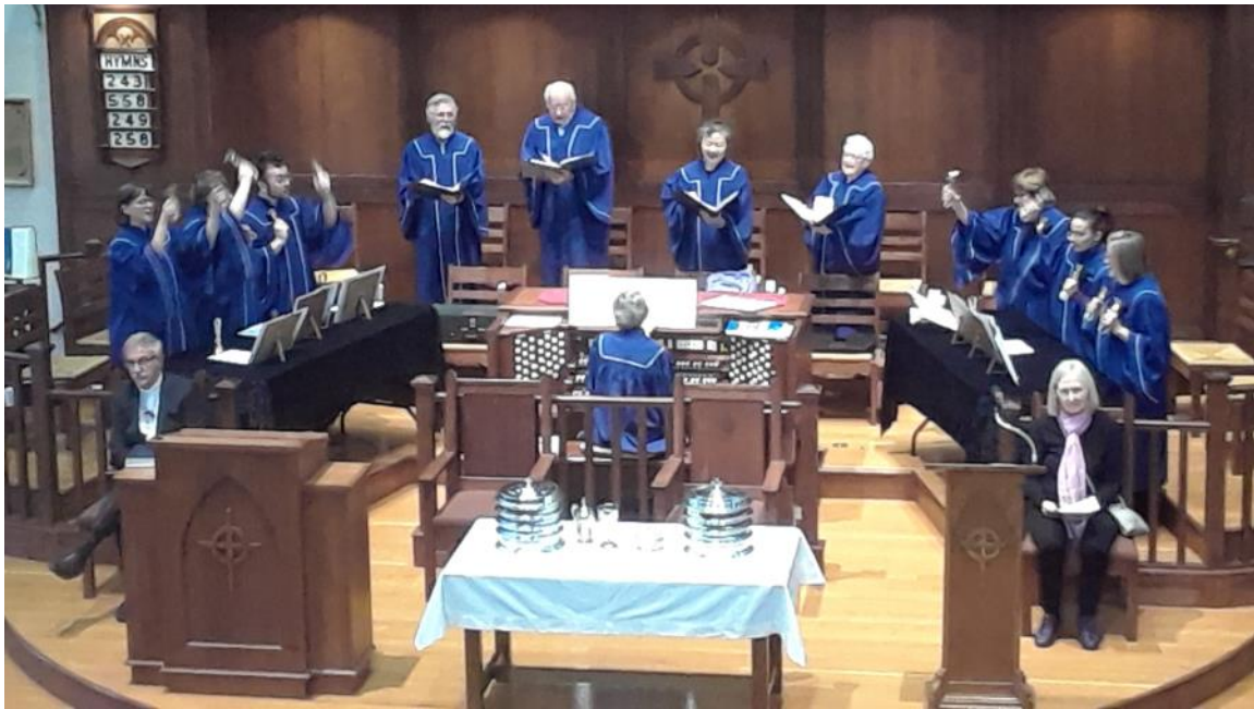
“Christ is Risen Indeed!”