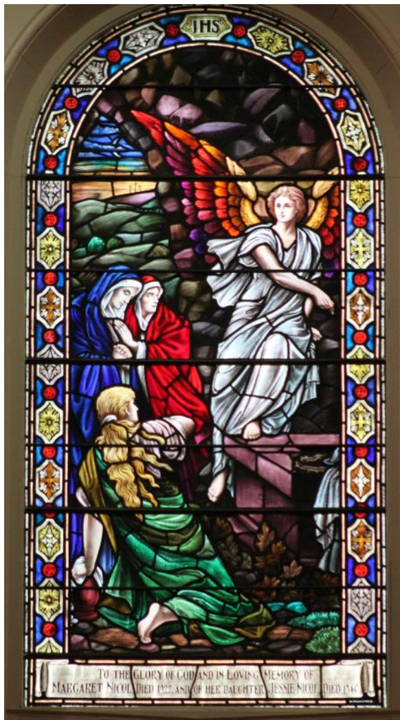
“He is not here.”