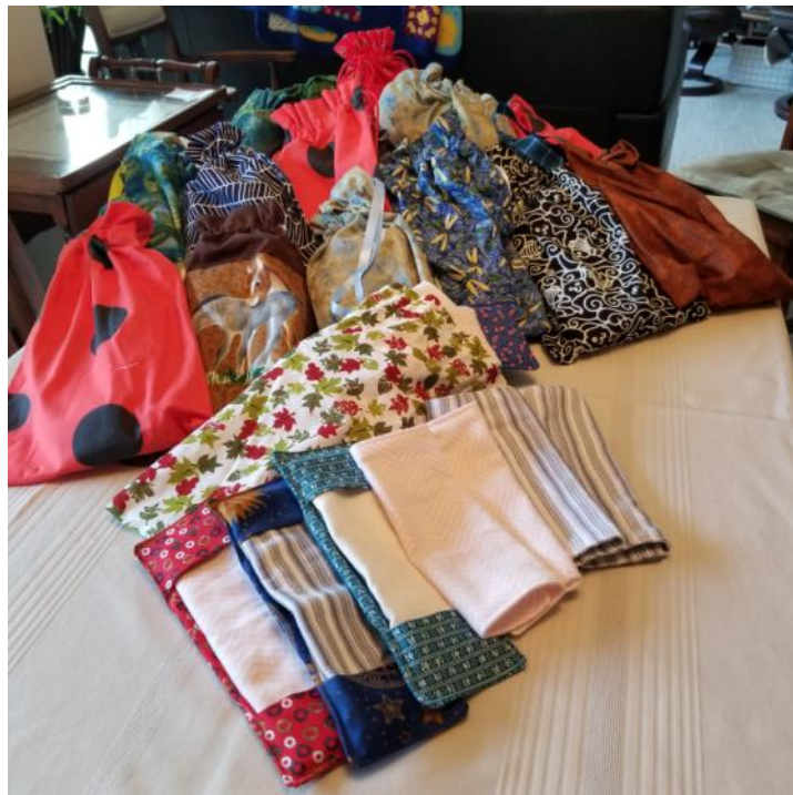
Completed dignity bags.

I've been asked if you need to be a talented seamstress to be part of the Activity Group. I assure you that you do not. Sewing skills are certainly very helpful and we have been blessed to have talented people as part of the group. There are, however, many small parts to all the projects. These parts do not require sewing skills and those who stop in on Thursday mornings have enjoyed a coffee and conversation, and also been able to help complete the projects.