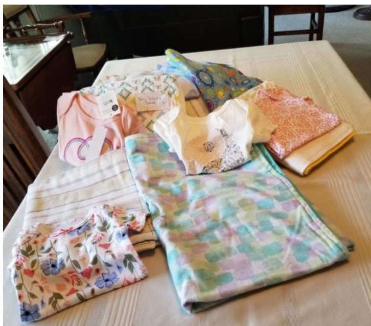
Six double-sided receiving blankets with onesies.

We finished up this year with a request for donations of sewing supplies. Once again St. Andrew's response has been overwhelming.