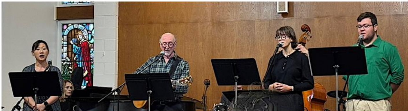
Joint Knox and St. Andrew's Worship Service November 10, 2024 at Knox Presbyterian, Victoria