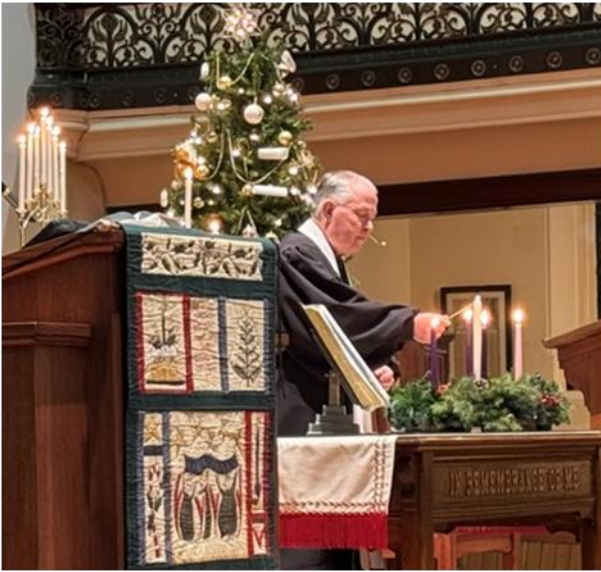
Christmas Eve Service—lighting the Christ Candle