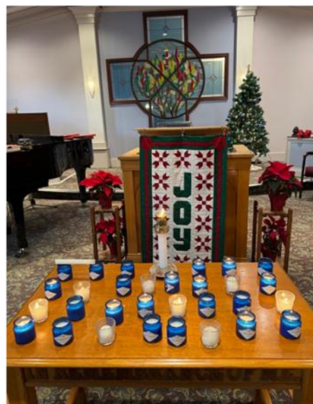
Blue Christmas Service at Trinity Presbyterian Church held on December 15, 2024 and attended by Saanich Peninsula, Knox, Trinity and St. Andrew's.