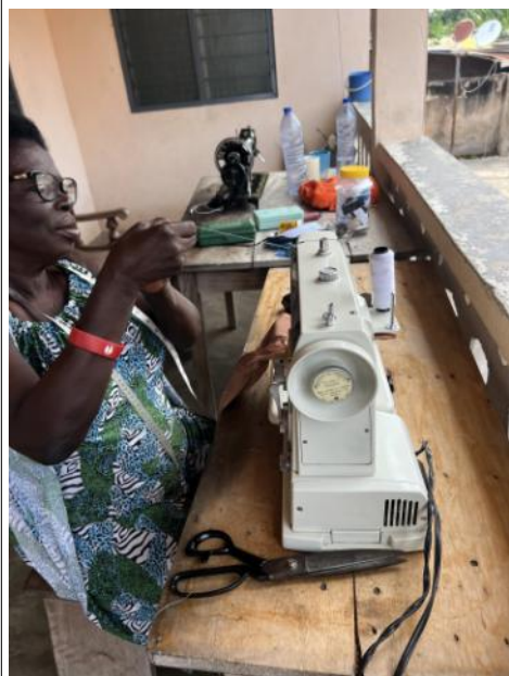
Skill Development Sewing Centre in Ghana