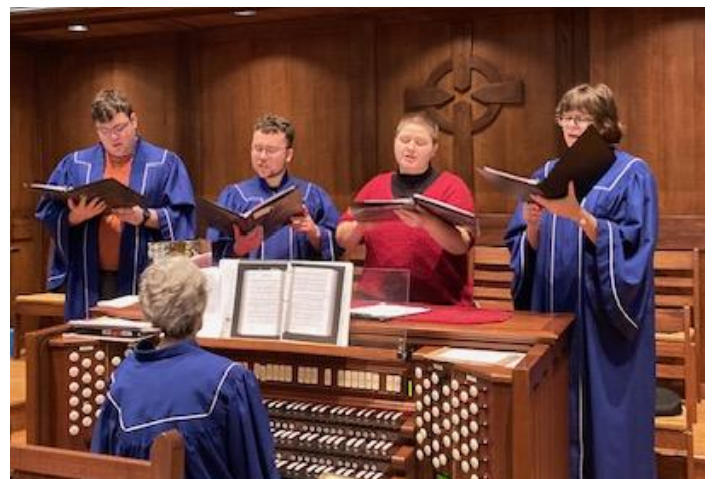
Communion Quartet at practice

To help you get to know our scholars better, we will publish a photo and bio of each one in the April Link . More importantly on April 6, after Worship, we will have a cake and celebration event for three of the four who have graduated or will be graduating this spring from UVIC. Please stay tuned for more information about their graduation recitals at the university. These recitals are open to the public.