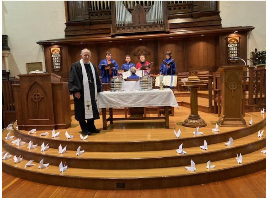
With flock of paper doves!