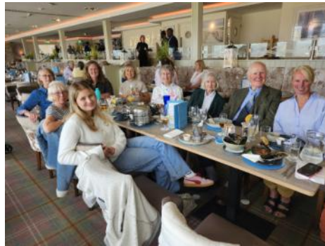
Luncheon with relatives.