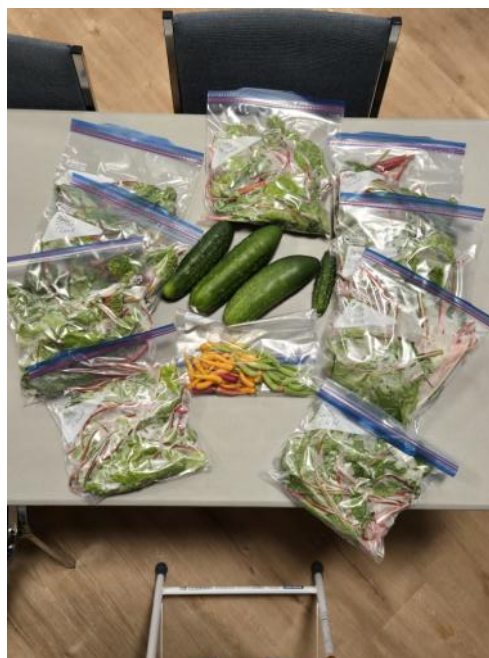
Bags of Swiss chard, carrots and cucumbers.