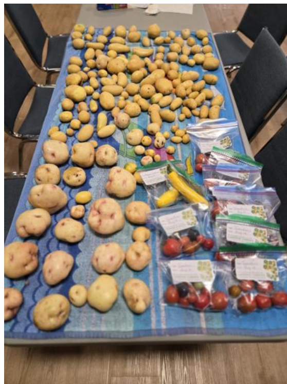
Potatoes cleaned and ready for packaging - 18 bags and about 15-20 lbs of the larger potatoes.