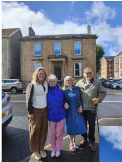
House where I was born.