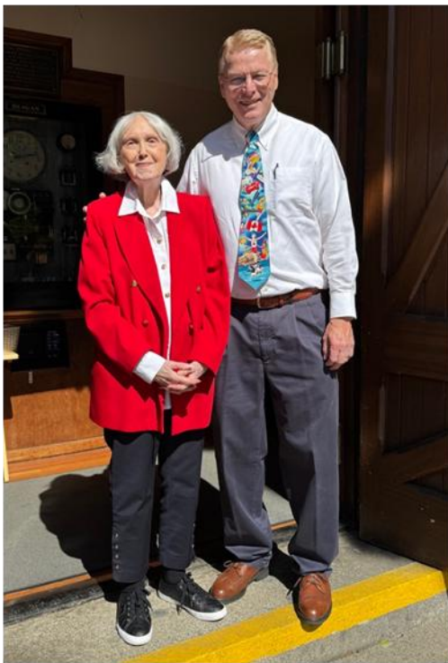
Canada Day Greeters – June 29 th Service - dressed for the occasion!

We know that Coffee and Conversation is an important part of our Sunday morning worship and friendship time each week. We are all happy that we can have this social time together.