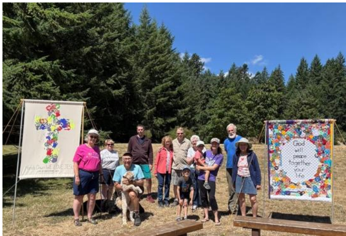
Camp VIP Goldstream Banner – God will piece together your life . Our 2024 banner, on the left, reads Hands Down WE LOVE JESUS! We ended with Communion on Sunday afternoon.