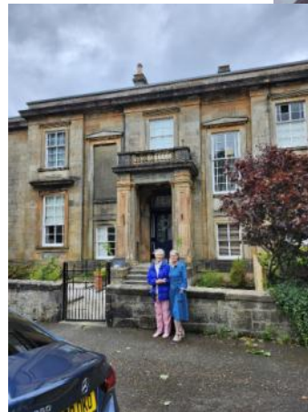
House where I lived before emigrating to Canada.