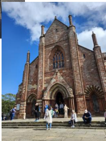
St. Magnus Cathedral