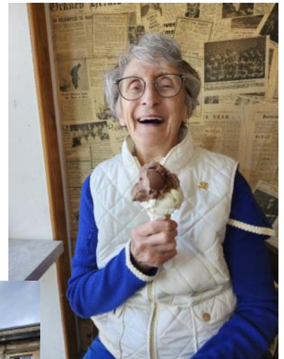
Enjoying a huge Orkney ice cream.