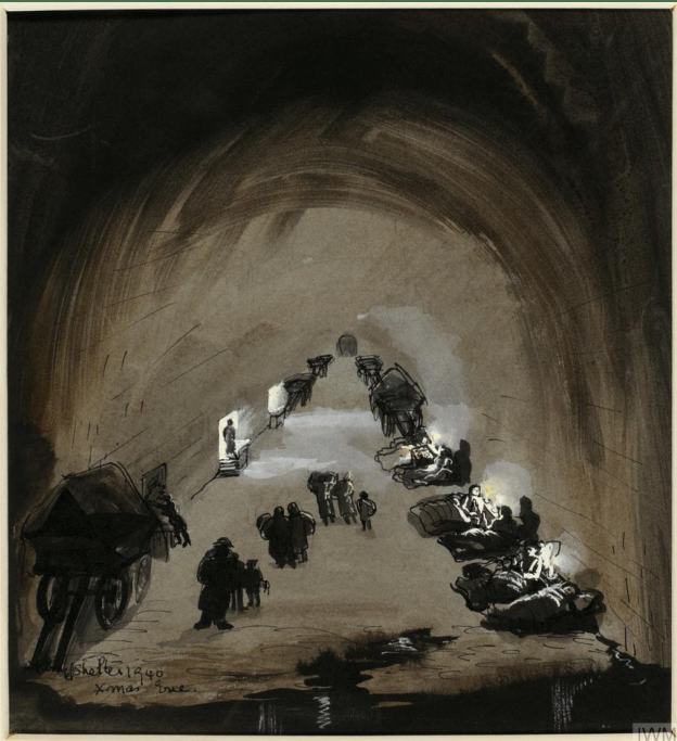
A Shelter in Camden Town under a Brewery: Christmas Eve, 1940, water colour by Olga Lehmann.

At first, people had been discouraged from going underground to sleep in tube stations, cave systems and storage areas as there was fear that driving citizens underground would disrupt the economy. The people persisted though as sleeping and even living in under the city was preferable to the alternative. Eventually the government got behind the use of public and private facilities as large scale shelters and by December 30th The Times reported that over 1,000,000 people spent Christmas underground.