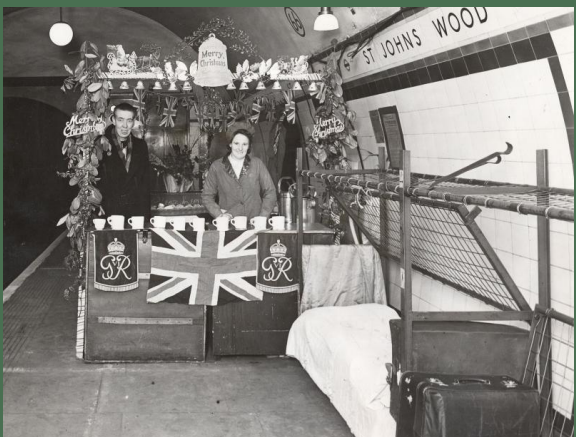
Shelter Warden Station at Christmas, 1940

However, as is often the case when times are hard, people found ways to make the most of the situation. Skits were performed, songs were sung, games were played. Even the shelter wardens got into the spirit as seen in the photo.