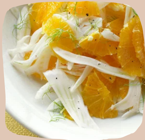
Adapted from Martha Stewart

Whisk together the first three ingredients and toss with sliced fennel bulb and oranges. Sprinkle with fennel fronds.